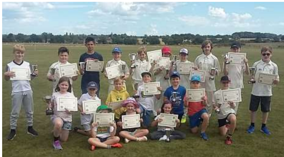
The Hales and Loddon Cricket Club end of season youth awards—see page 31