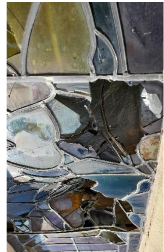
One of the damaged panes

The damage to the East window of the church was considerable. It has a lot of mediaeval stained and painted glass, some from France and Germany, and has been removed for the work to be carried out. Terry Devlin of Devlin and Plummer Stained Glass wrote,